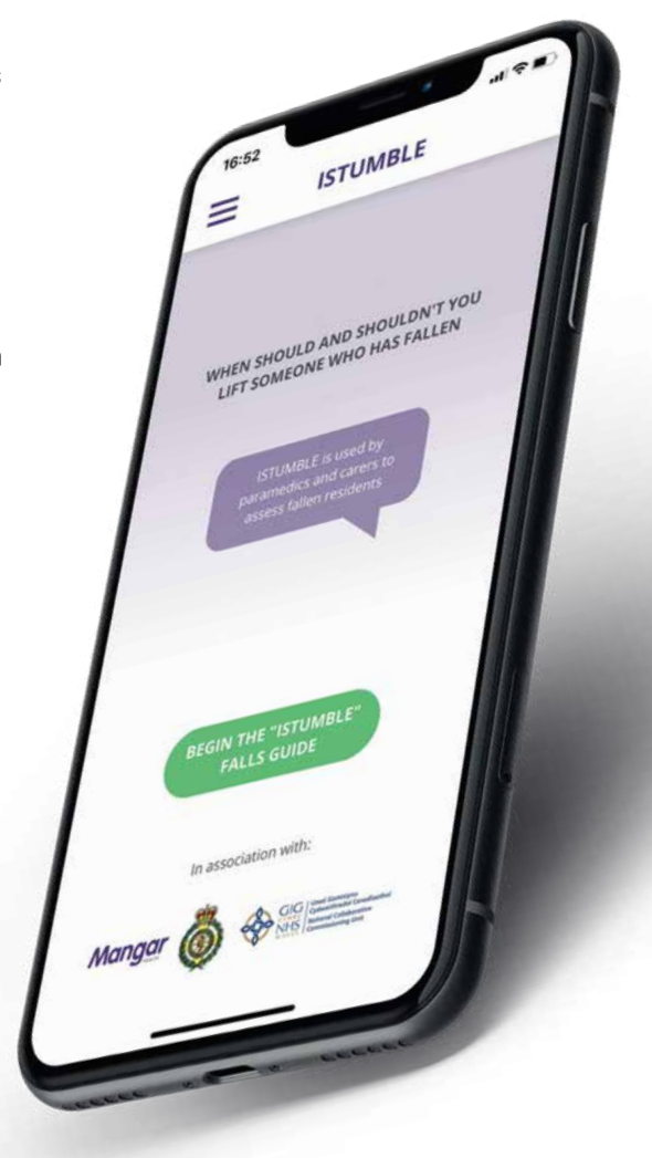
Download the new ISTUMBLE APP