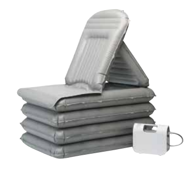
MANGAR Camel Lifting Cushion LSS403810