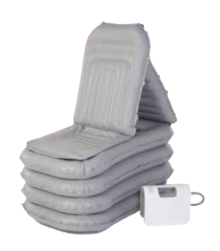
MANGAR Eagle Lifting Cushion LSS403800